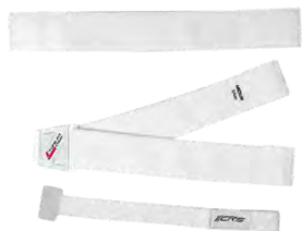
RP TUNE FIT STRAP KIT (PACK) 1052524